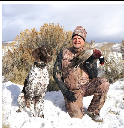
Braya Vom Hochland D1 S1 Fw: V (pup SG1)

At the 2020 Dr. Kleemann Prüfung there will be not less than five dogs owned by members of the DKGNA. This article features the fourth KS hopeful and his owner.