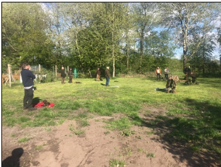
Puppy training with 1-drahthaar 1-Stoberhund 3-pudelpointers 1-longhair 1- black DK 1- munsterlander

properly with the puppy. I later found he used a simple German whistle to easily train the dog to “whoa” with the long end creating a stutter noise. I realized the dog easily recognizes the sound to stop or lay down (accepted with German rules). The short end of the whistle was to communicate direction and to come back. Very simple. Very direct. I was dumbfounded by how difficult I have tried to train via the English-language/field trail pros/books/etc; and only to realize there is a simpler way to train just by watching Thorsten.