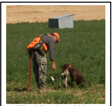
Flirt delivering rabbit to Wayne Touve

very steady!! Just as impressive was the rabbit drag. Flirt followed the drag perfectly and retrieved the rabbit to hand with out issue. It should be noted that the rabbit was huge! The duck drag was completed without flaw. At the water the gun sensitivity and blind were flawless. However, the dick search mirrored the earlier one and she received a deduction. Congratulations Flirt and Wayne Prize II.