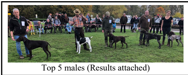
Top 5 males (Results attached)

The Kleemann was smaller than usual because of the misguided restrictions imposed because of fear of too many dogs having COVID causing the cancellation of the 2020 Kleemann. In all only 86 dogs entered the event, down from the usual 120-130. The number of dogs be lower did not impact the quality of the dogs as there were many excellent dogs participating.