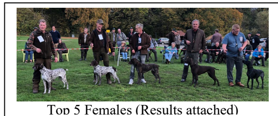
Top 5 Females (Results attached)

Thursday was registration and the Zuchtschau. It's your opportunity to visit with old friends and make new ones. Additionally, you have your first look at all the dog's, and each is evaluated by a panel of judges. The dogs are split into two rings one for